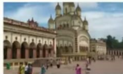
Dakshineswar Kali Bari