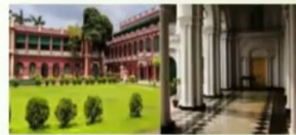
Jorashanko (Tagore's house)