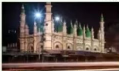
Tipu Sultan Mosque